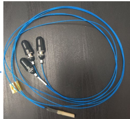
Micro-ring resonator sensor element